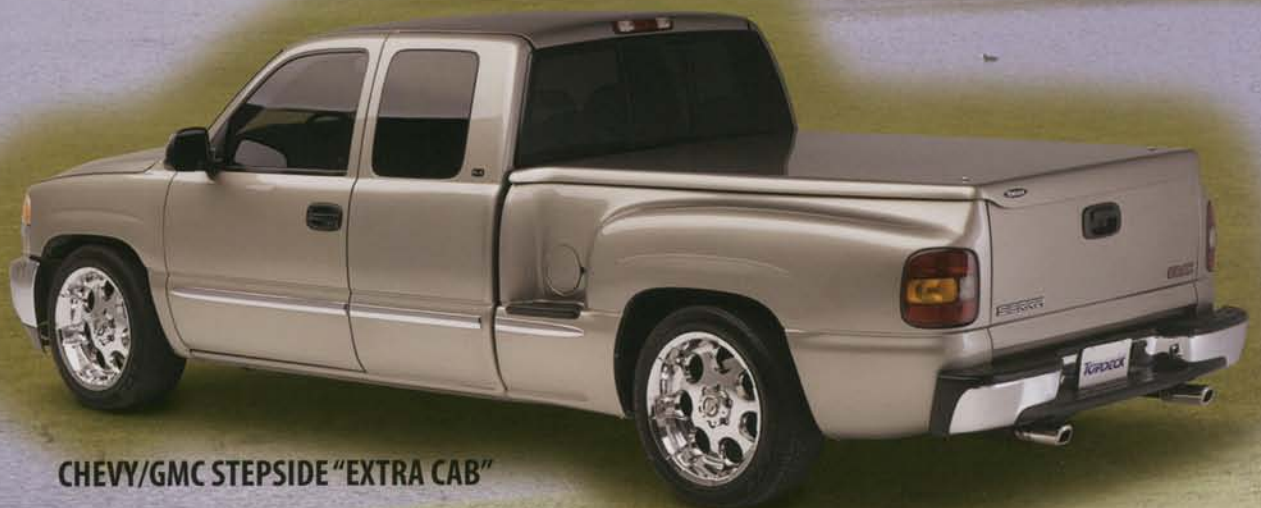
CHEVY/GMC STEPSIDE "EXTRA CAB"