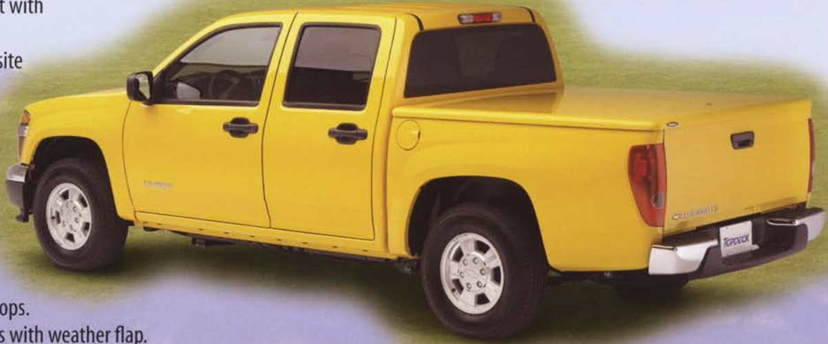
COLORADO/CANYON "CREW CAB"