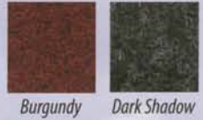
Burgundy Dark Shadow