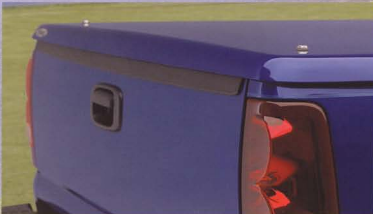
"Straight Cut" (Optional) on Chevy/GMC