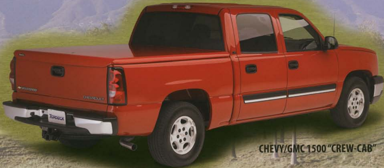
CHEVY/GMC 1500 "CREW-CAB"