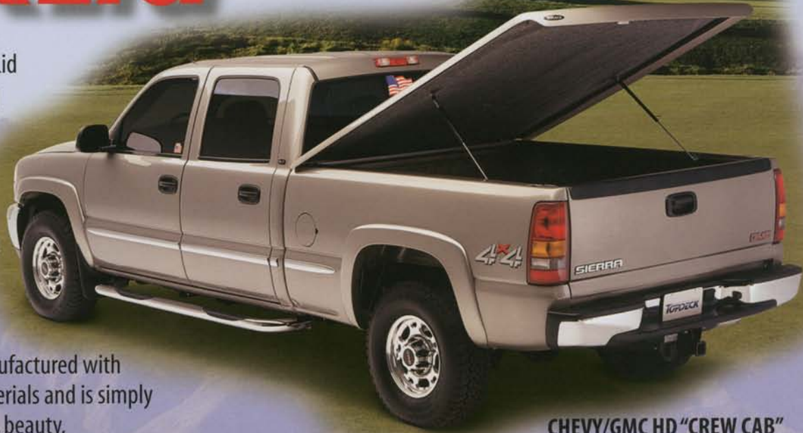
CHEVY/GMC HD "CREW CAB"

Each Decklid® is carefully manufactured with state-of-the-art composite materials and is simply unmatched in its craftsmanship, beauty, and precise custom fit.