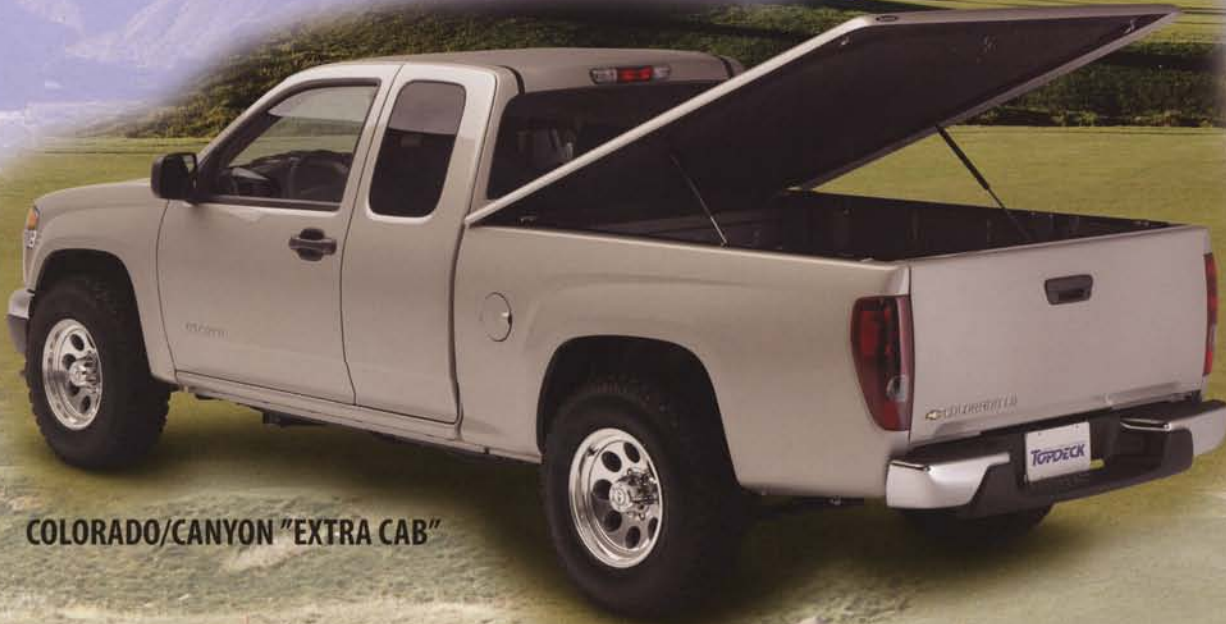
COLORADO/CANYON "EXTRA CAB"