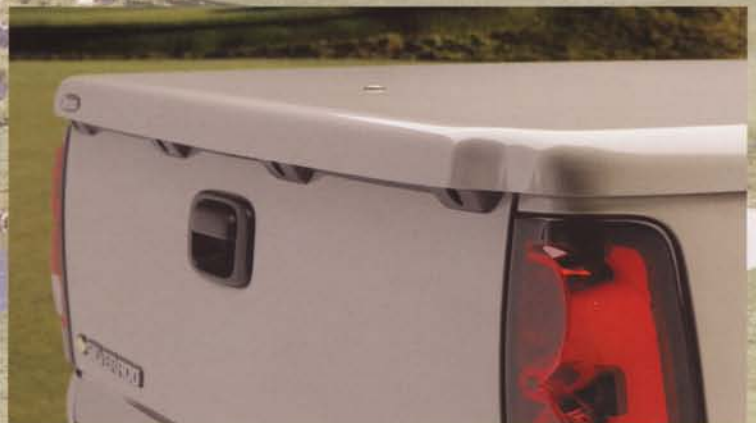
"Silverado Style" (Optional) on Chevy/GMC