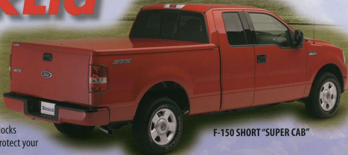
F-150 SHORT "SUPER CAB"

Each Decklid® is carefully manufactured with state-of-the-art composite materials and is simply unmatched in its craftsmanship, beauty, and precise custom fit.