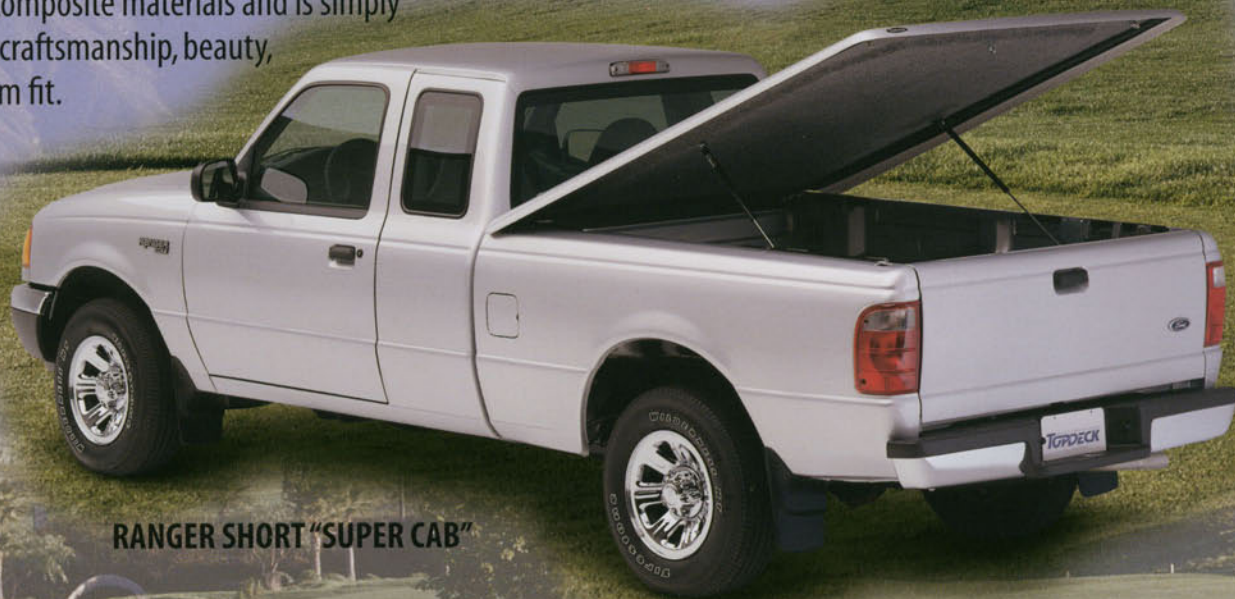
RANGER SHORT "SUPER CAB"