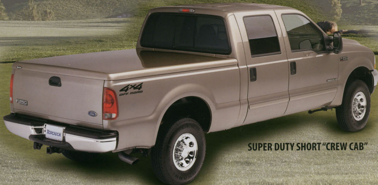
SUPER DUTY SHORT "CREW CAB"